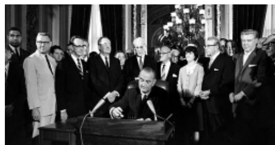
LBJ SIGNS THE VOTING RIGHTS ACT

In addition, the website will include on-line video presentations and tutorials explaining redistricting concepts. An important component of these on-line tutorials will focus on the development of a litigation manual that will provide a checklist for those